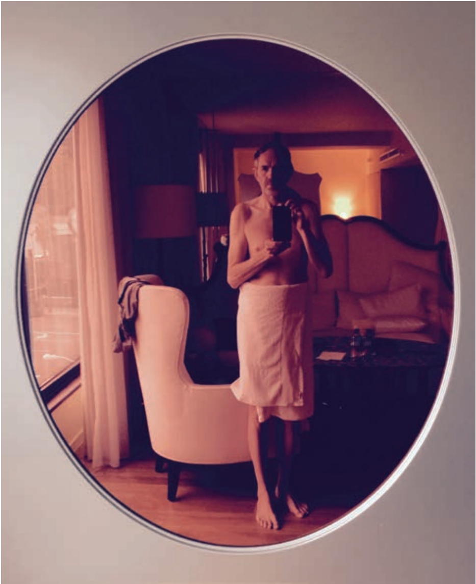
Self-portrait in hotel room, Hollywood 2016